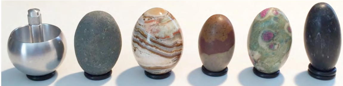
Figure 1 (from left to right): (a) aluminum tippe top; (b) natural pebble; (c) polished agate stone egg; (d) classic Lingam stone; (e) ruby/fuschite Lingam stone; (f) black Lingam stone. Each is about 5 cm tall.

Study of the problem of the rise of the center of mass (COM) of spinning objects is usually said to have begun in the late nineteenth century. These early mathematical treatments aimed to explain the motion of the newly invented and patented “tippe top” (Fig 1a). This semi-spheroidal top will invert when spun on a smooth surface while raising its COM. Because of the importance of friction in its dynamics, such a nonholonomic system is not readily amenable to analytic treatment, or of intuitive understanding. In notes written in 1844 — well before the invention of the tippe top in 1891 — William Thomson (later, Lord Kelvin) appears to have been the first person to analyze the problem of the rising COM of spinning objects. As a young student, he experimented with both oblate and prolate ellipsoidal pebbles (Fig. 1b), but never did a complete analytic theoretical treatment of the problem. J. H. Jellett, in his 1872 book Theory of Friction , provided a partial account of the related problem of the rise of the COM for an egg-shaped (ovoid) object (Fig.1c), making use of a new (adiabatic) invariant of the motion that he devised.