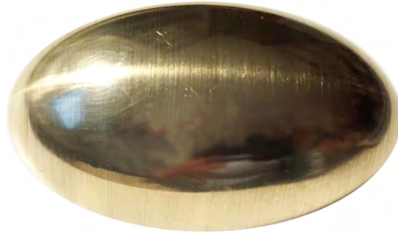
Figure 3. A brass version of the \Phi TOP with major axis \sim 5.1 cm, weighing \sim 220 grams.

Taking the equation for an ellipsoid and setting the ratio c/a equal to \Phi which is the inverse of the often defined “golden mean” (or “golden ratio” or “phi” or “ \phi ” - lower case), c/a = \Phi = 1/\phi = (1 + 5^{1/2})/2 \sim 1.61803398\dots ) one has what can be called the “golden ellipsoid” - a uniquely shaped solid body. This object exhibits near optimal rotational performance in the physical sense discussed above. It explicitly includes the golden mean in its shape, and looks visually appealing.