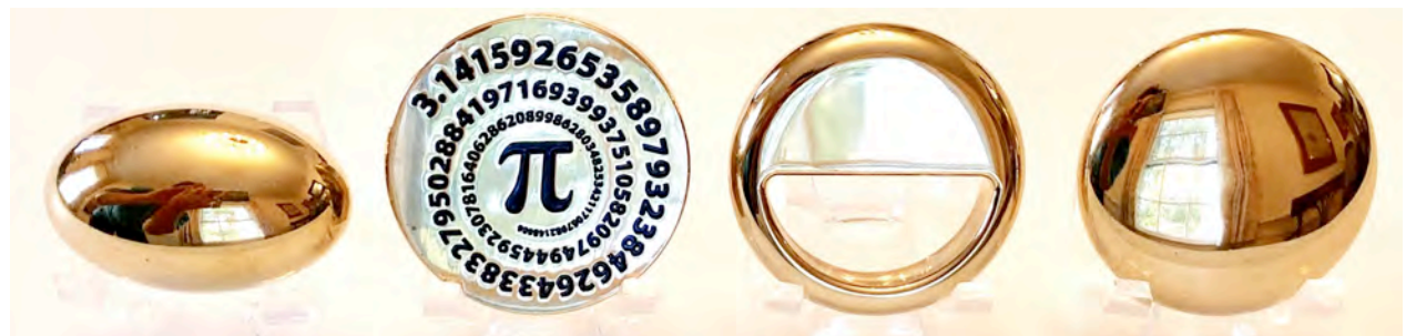
Figure 1 (from left to right): (a) brass \phi TOP ® ; (b) brass \pi TOP ® ; (c) brass i TOP; (d) brass e TOP.

During 2016 and 2017, I studied the physics of spinning and rolling coins and flattened disks (right circular cylinders). As in the case of spinning egg-shaped objects, there is a lengthy literature of the physics of spinning coins that dates back at least to the 19 th century. As with the PhiTOP ® , I conducted a series of experiments to determine the “optimal” coin or disk (that is, one that spins and precesses for the longest time). The maximum duration spinning and rolling (precession) time was found to depend mainly on the ratio of the disk radius r to disk thickness t . I found experimentally that with r/t \sim 3 one produced the longest duration motion. I then chose r/t to be equal to \pi \sim 3.1415\dots and named the resulting object the “PiTOP ® ” or “ \pi TOP ® ”. Its volume V is exactly equal to r^3 . The design that appears on one surface consists of a spiral containing the first 109 digits of \pi along with the Greek letter \pi in the middle. The PiTOP ® was first presented at the “Gathering for Gardner” (G4G13) event in Spring 2018. More about the PiTOP ® can be found at: http://www.thepitop.com .